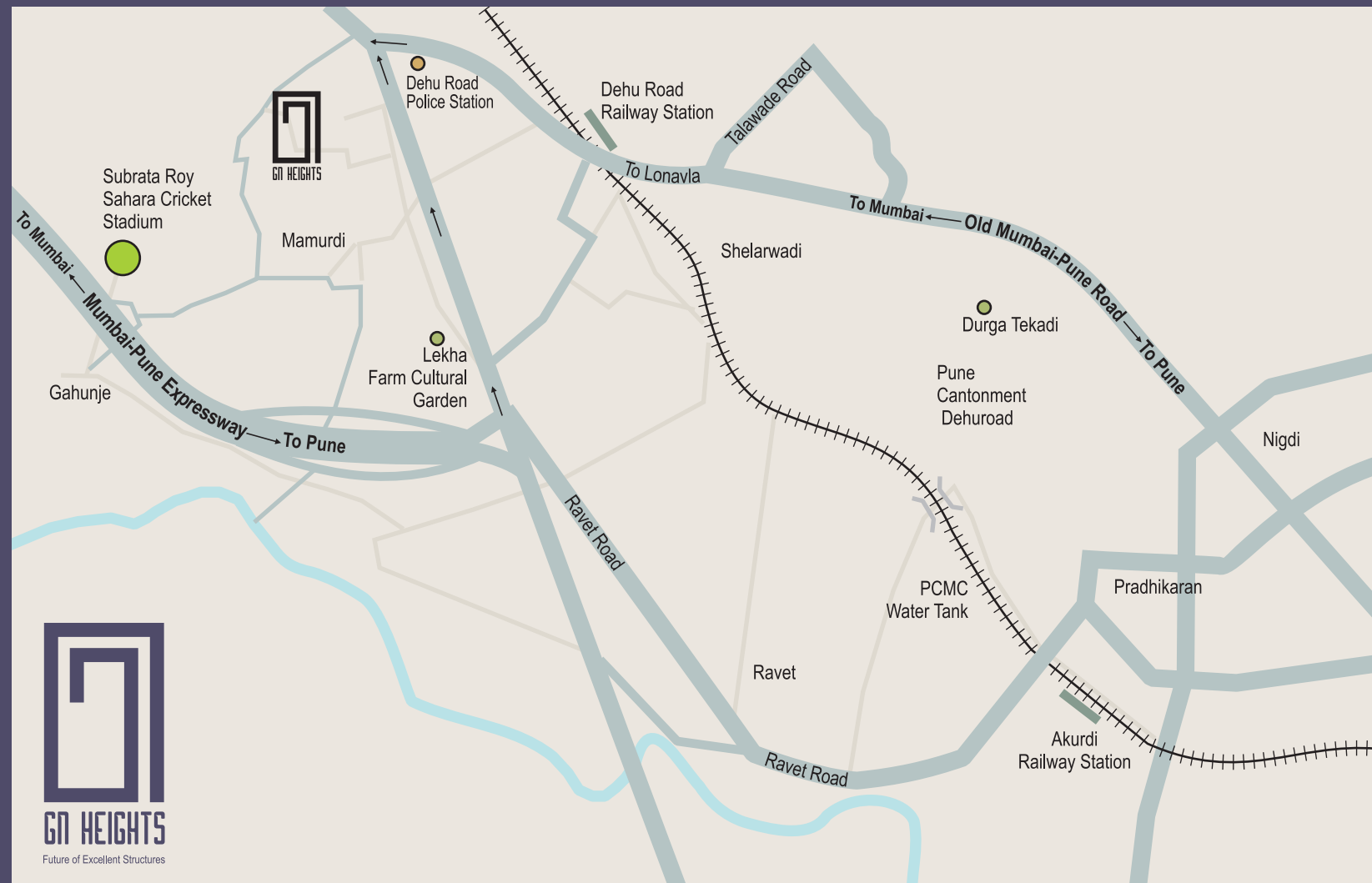
Site - GN HEIGHTS S. No. 15/3+4+5+6/2, Sainagar Near, Subrata Roy Cricket Stadium, Mamurdi, Pune-412101